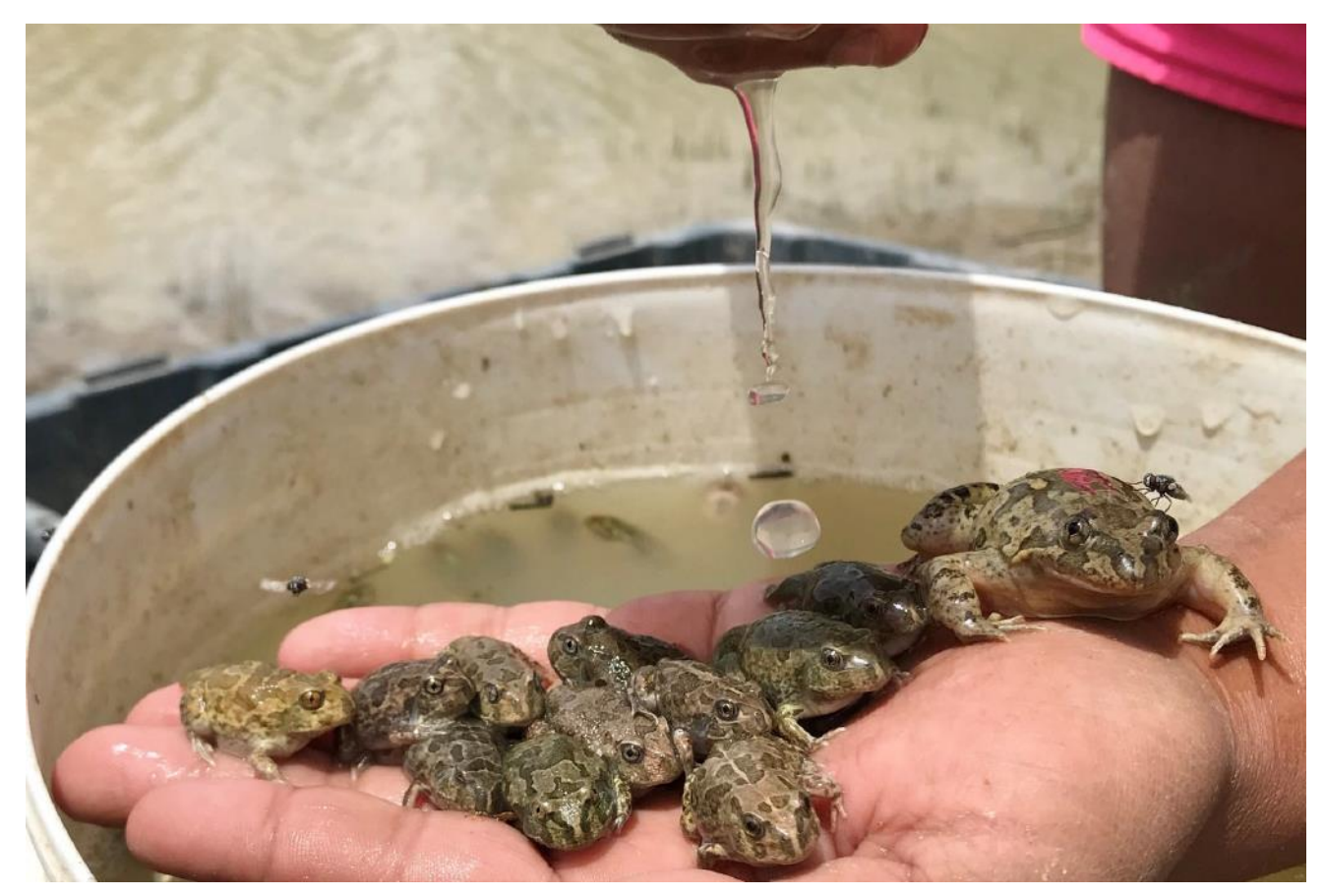
Figure 1: A handful of Burrowing Frog metamorphs (the small frogs) and an adult Long-thumbed Frog found at Lake Littra on the Chowilla Floodplain during a frog survey (Grace Hodder, DEW)